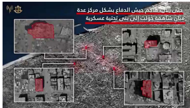
Sites of attacks by IDF forces

the ground maneuver inside Gaza City, after more than 850 targets were attacked and hundreds of terrorist operatives were eliminated during the week. Among other things, high-rise buildings used by Hamas for observation and carrying out terrorist activities against IDF forces, operational tunnel shafts, weapons depots, sniper posts, and other terrorist infrastructures were attacked, some of which operated in civilian facilities (IDF Spokesperson, September 9-16, 2025).