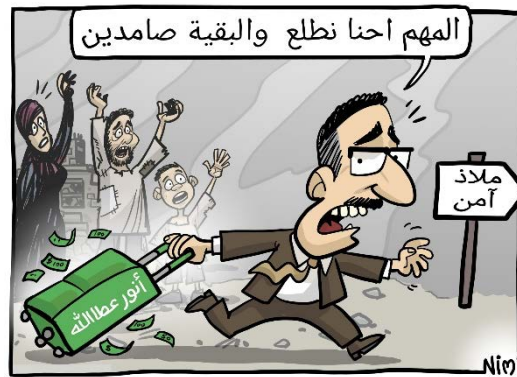
Hamas officials fleeing Gaza while leaving civilians behind