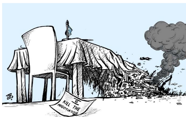
Cartoon by Imad Hajaj: The negotiating table is bombed and empty, and next to it is a note with the inscription "Kill the mediator" with the Star of David symbol (Al-Araby Al-Jadeed, September 9, 2025)