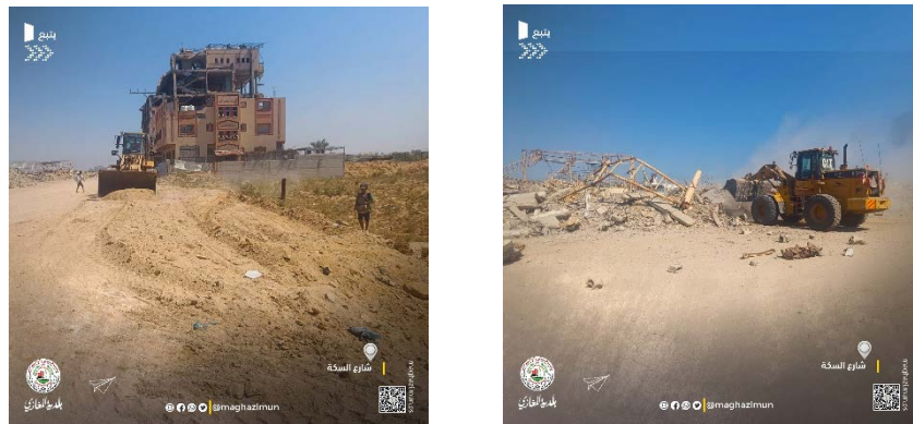
Works of al-Maghazi municipality