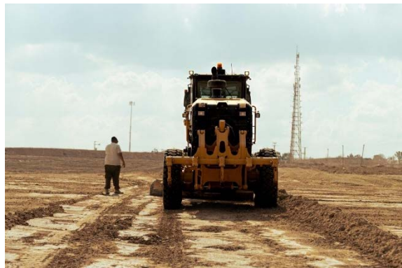
Expansion of Crossing 147 (IDF Spokesperson, September 12, 2025)

► Hamas and its allies in the Gaza Strip continued their efforts to prevent the passage of residents out of Gaza City in accordance with IDF instructions, claiming that the areas designated for the absorption of the displaced were already full. The following are prominent examples: