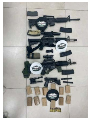
Weapons seized in Nablus (“Al-Khalil fi Qalb al-Hadath” Telegram channel, September 10, 2025)

► The PA’s Preventive Security Force in Nablus reported the seizure of a significant quantity of weapons on Al-Quds Street in the city (“Al-Khalil fi Qalb al-Hadath” Telegram channel, September 10, 2025).