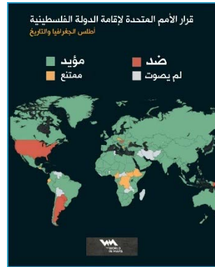
Map of votes at the UN General Assembly: countries supporting (green) and opposing (red) (Atlas of Geography and History Facebook page, September 12, 2025)

◆The Fatah movement reported that the document confirms the two-state solution and the realization of the Palestinian people’s right to self-determination and establishing a state with East Jerusalem as its capital. The statement said that the resolution is important and reflects consensus to end “occupation” and places political, moral, and legal responsibility on the world (Odeh channel, September 12, 2025).