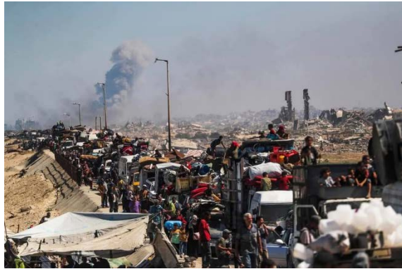
Residents evacuating the Gaza Strip

► As part of the preparations, the IDF also expanded “Crossing 147”, which is used for the passage of aid trucks into the Gaza Strip, as part of the relocation of the population from southern Gaza City for its safety and to improve the humanitarian response in the southern Gaza Strip. According to the IDF’s announcement, new routes have been paved, and the goods area has been expanded. It was noted that upon completion of the work, reception capacity will increase to about 150 trucks per day, three times the current situation, which will allow increased aid entry, mainly food, to the humanitarian space (IDF Spokesperson, September 12, 2025).