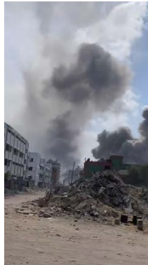
Explosions in Gaza City at the beginning of the IDF maneuver (September 16, 2025)

operating in Gaza City and of a severe shortage in blood units, medications, and life-saving equipment (Al-Jazeera Mubasher, September 16, 2025).