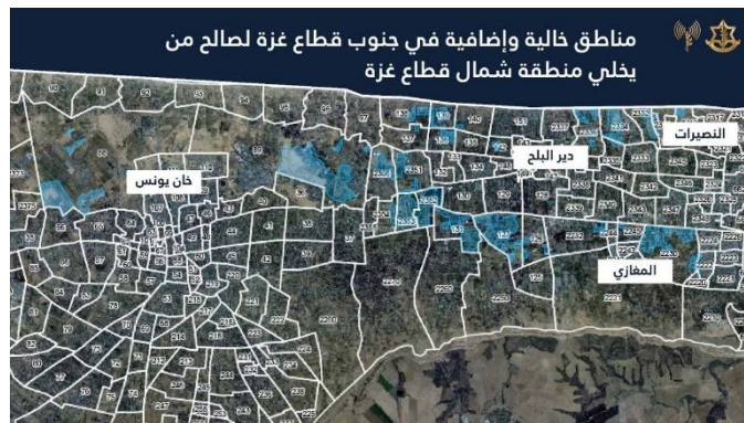
Map of the vacant areas for refugees from the north (marked in blue) (COGAT Facebook page, August 27, 2025)

►The Israeli Coordinator of Government Activities in the Territories (COGAT) reported that the evacuation of Gaza City was inevitable and that there were extensive vacant areas in the central and southern Gaza Strip in the al-Mawasi area. He added that every family that moved south would receive increased humanitarian aid, and reported that the IDF had begun bringing in tents, preparing areas for aid distribution centers, and laying water lines and other facilities for the evacuees (COGAT Facebook page, August 27, 2025).