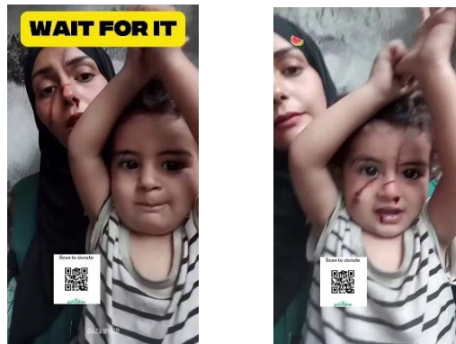
Right: Cuts seen on the little girl's face. Left: The same cuts on the mother's face (IDF spokesperson in Arabic, August 27, 2025)

►The IDF spokesperson published a video released by the Palestinians, in which a Palestinian woman spoke of "hunger." However, according to the IDF spokesperson, the video used artificial intelligence (AI), which also caused glitches, such as "cuts" which transferred from the face of the girl in the video to her mother (IDF spokesperson in Arabic, August 27, 2025).