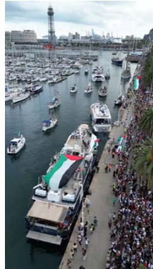
The ships in the port of Barcelona before departure (Global Steadfastness Flotilla X account, August 31, 2025)

returned to port due to stormy weather but they set sail again a few hours later (Reuters and the Global Steadfastness Flotilla X account, September 1–2, 2025).