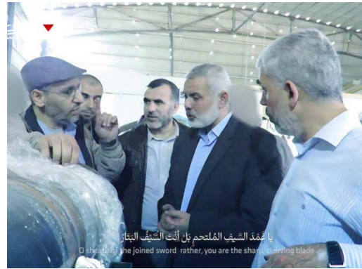
From the video dedicated to Muhammad al-Deif ( Hamas Telegram channel, August 30, 2025)