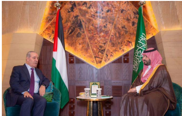
Al-Sheikh meets with Mohammed bin Salman (Wafa, September 1, 2025)

in the Gaza Strip and agreed on continued close coordination to promote the establishment of a Palestinian state (Wafa, September 1, 2025).