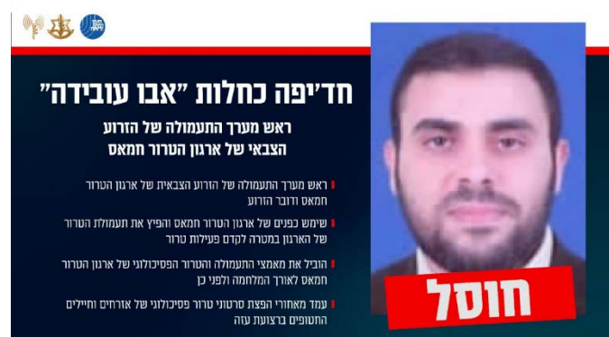
Abu Obeida's ID card (IDF spokesperson, August 31, 2025)

Jabaliya in the north of the Strip and the outskirts of Gaza City, part of preparations for the takeover of the city. The forces attacked terrorist squads and eliminated terrorist operatives, including Abu Obeida, spokesman for the Hamas military wing, and the head of ISIS's "Palestine" district. The forces destroyed buildings used for military purposes, rocket and weapons storehouses, tunnels and underground facilities, rocket launching and sniper positions, some operating in or near civilian buildings. IDF forces and the Israel Security Agency also recovered the bodies of two Israelis who had been kidnapped in the October 7, 2023 attack and massacre. An IDF officer was killed in an operational accident in Khan Yunis (IDF spokesperson, August 26–September 2, 2025).