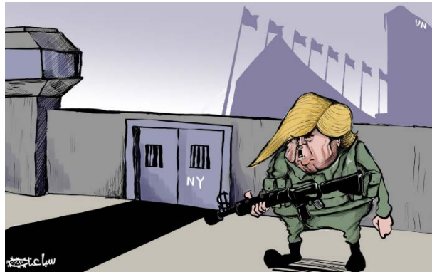
The American ban imposed on PA figures (cartoonist Muhammad Sabaaneh's Facebook page, August 30, 2025)

exemptions under the Headquarters Agreement hosting the UN headquarters in New York, and the United States would consider renewing contact with the PA if it met its obligations and took practical steps to return to the path of compromise and dialogue with Israel (United States State Department website, August 29, 2025).