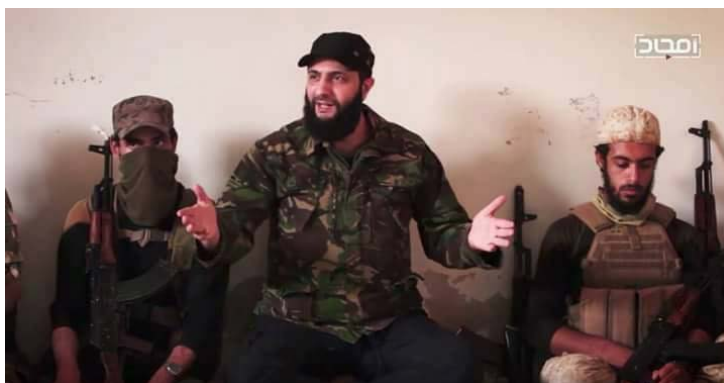
Right: Al-Sharaa in conversation with Hay'at Tahrir al-Sham operatives (Orient News YouTube channel, November 30, 2017). Left: Al-Sharaa planning operations in the command room (Shahed Ayyan Aleppo Facebook page, March 24, 2017)

► Under al-Sharaa's leadership, Hay'at Tahrir al-Sham became the dominant organization in the Turkish-backed enclave established in the Idlib region of northwestern Syria, part of efforts to end the civil war. The organization established a civilian administrative infrastructure under the supervision of the Syrian Salvation Government, and issued identity