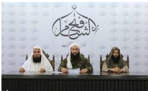
Al-Sharaa (center) announcing the establishment of Jabhat Fath al-Sham.