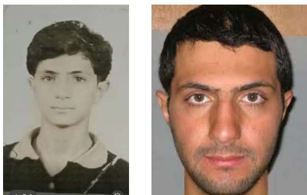
Ahmed al-Sharaa as a child and young man

► Ahmed al-Sharaa attended the neighborhood high school and was described by his classmates as a diligent, intelligent, handsome student, though introverted and somewhat shy (Syria TV, December 24, 2023). At times, he also contributed to the family's livelihood by working in the grocery store (INSS, December 24, 2024).