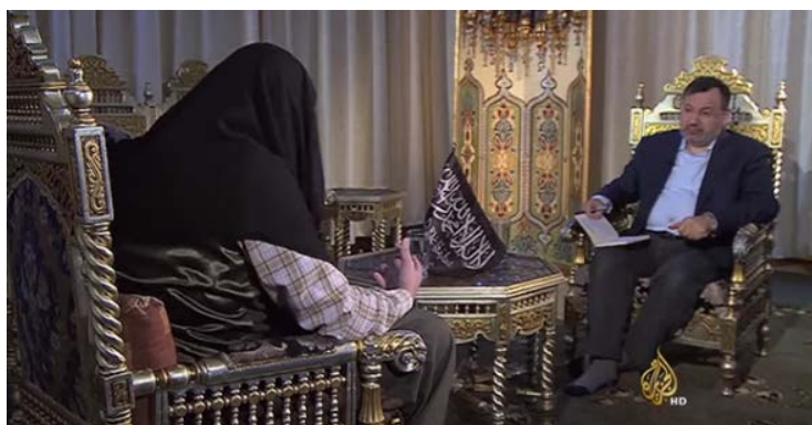
Al-Sharaa (with his back to the camera) in his first interview (al-Jazeera, May 27, 2015)

► In a May 2015 interview, al-Sharaa presented his "updated" ideology, emphasizing Syrian nationalism over global jihad. He said the organization was fighting only within Syria and against Hezbollah, which supported the Assad regime, and that there were directives to avoid attacks on the United States and the West from Syrian territory. He added that Jabhat al-Nusra fought only against those who fought it, and if the Alawites disassociated themselves from Assad's regime and laid down their arms they would receive protection. He also noted that they were not at war with Christians and he did not consider secular Muslims infidels (al-Jazeera, May 27, 2015). In another interview, he stated that the Kurds were Muslims and part of Syria (Orient News TV, December 12, 2015).