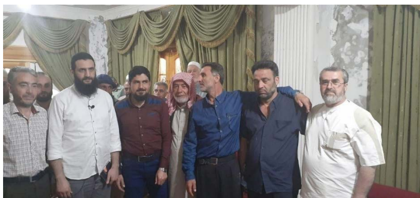
Right: Al-Sharaa with operatives in Idlib (Baladi News, June 1, 2020). Left: Al-Sharaa at the ceremony opening the road between Aleppo and Bab al-Hawa (The Syrian Observer, January 10, 2022)