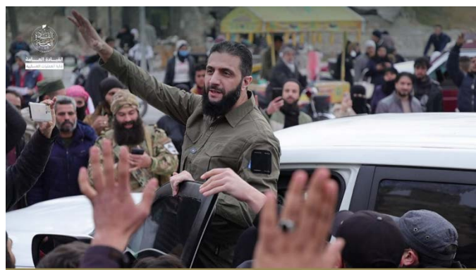
Right: Al-Sharaa upon his arrival in Aleppo after the liberation. Left: Al-Sharaa upon his arrival in Damascus

► Al-Sharaa implemented the governance model used in Idlib across all the territories under the revolutionaries' control in Syria. The Syrian Salvation Government became the foundation for an interim government expected to govern at least until March 2025. Additionally, committees were established to address civil issues in various provinces, including waste removal, provision of electricity, water, bread, stabilization of the public sphere following the