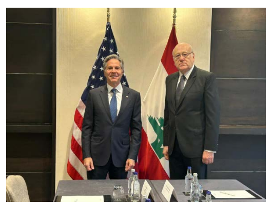
Mikati (left) and Blinken

would fully implement Resolution 1701 and allow displaced persons in both Israel and Lebanon to return to their homes (United States Department of State website, October 25, 2024).