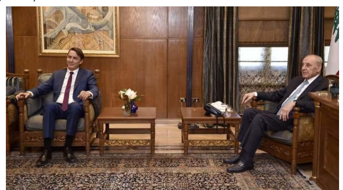
Berri and Hochstein (left) (al-Nashra, October 21, 2024)

• Hochstein said the meeting with Nabih Berri, the speaker of the Lebanese Parliament, had been "very constructive." At a press conference Hochstein stated that the United States was collaborating with the governments of Lebanon and Israel to "find a formula that will end the confrontation between them once and for all." He added that merely committing to Security Council Resolution 1701 was insufficient and that "tying Lebanon's fate to other conflicts is not in the Lebanese people's interest" (Reuters, October 21, 2024).