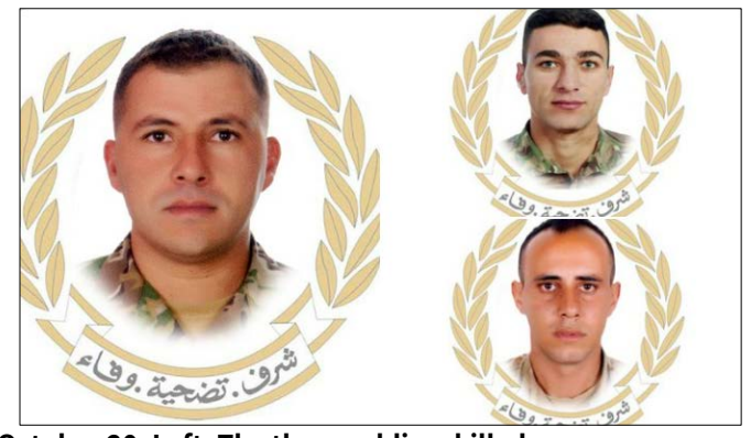
Right: The three Lebanese Army soldiers killed on October 20. Left: The three soldiers killed on October 24 (Lebanese Army X account, October 21 and 24, 2024)

▶ On October 23, 2024, Lebanese Army Commander Joseph Aoun met with German Foreign Minister Annalena Baerbock in Beirut. They discussed the general situation in Lebanon and ways to support the Lebanese army in facing current challenges (Lebanese Army X account, October 24, 2024).