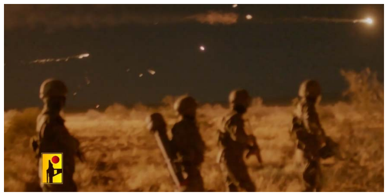
From the video "Haifa will be like Kiryat Shmona and Metula"