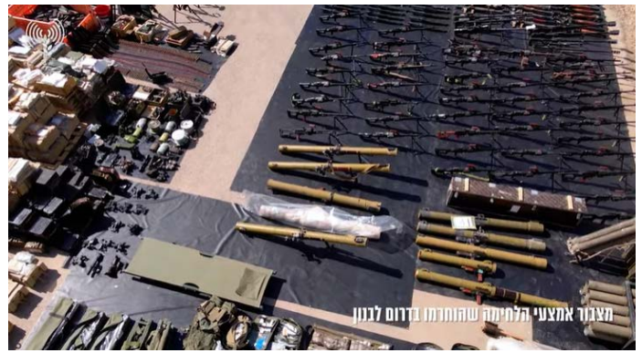
Right: Weapons discovered by IDF forces in south Lebanon. Left: Destruction of an underground tunnel in south Lebanon

• Attacks on sites where Hezbollah stored funds: On the night of October 20, 2024, the IDF carried out dozens of airstrikes on Hezbollah headquarters and sites used to store funds for its military wing. The strikes targeted assets of the al-Qard al-Hasan Association,<sup>2</sup> Hezbollah's financial arm, which supplies Hezbollah the funds to purchase weapons and pay salaries to military operatives (IDF spokesperson, October 21, 2024).