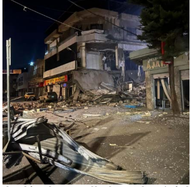
A branch of the al-Qard al-Hasan Association attacked in the Ba'albek market

• Eliminating Hezbollah terrorist operatives: The IDF continued eliminating Hezbollah operatives, including regional commanders in south Lebanon and members of its air wing (IDF spokesperson, October 14-26, 2024). According to the IDF spokesperson, during the operations in south Lebanon (as of October 21, 2024), the IDF eliminated at least seven Hezbollah brigade commanders, 21 battalion commanders, and 24 company commanders (IDF spokesperson, October 21, 2024).