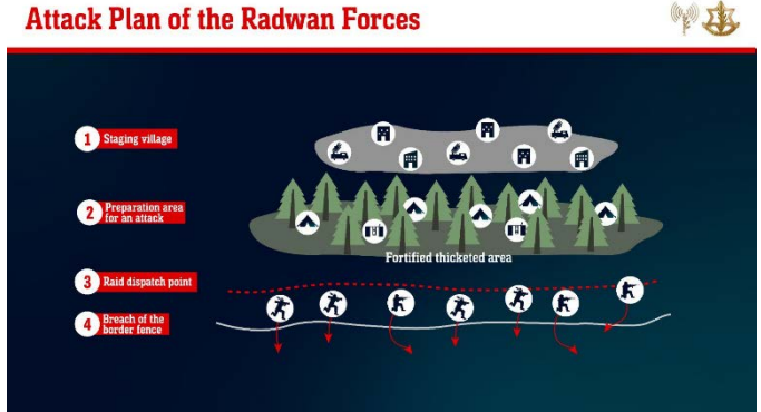
Radwan Force plan to attack Israeli, based on IDF discoveries in south Lebanon (IDF spokesperson, October 24, 2024)

On October 24, 2024, the IDF exposed how Hezbollah's Radwan Force was arrayed in south Lebanon. It established facilities in areas near the Israeli border fence, transforming civilian villages into fortified military strongholds, and from there advanced towards the fence, turning the areas into fortified attack zones camouflaged by dense vegetation. There they situated means for raids on communities in northern Israel, including weapons, explosives and motorcycles. During IDF operations in the village of Mhaibib in south Lebanon, the forces uncovered an extensive Radwan Force underground headquarters hidden under homes in the village. There were entry shafts leading to a long tunnel network, reinforced with concrete and containing facilities for prolonged stays, including sleeping quarters, kitchens, food supplies, showers, motorcycles and large quantities of weapons, all part of deployment for attacking Israel (IDF spokesperson, October 24, 2024).