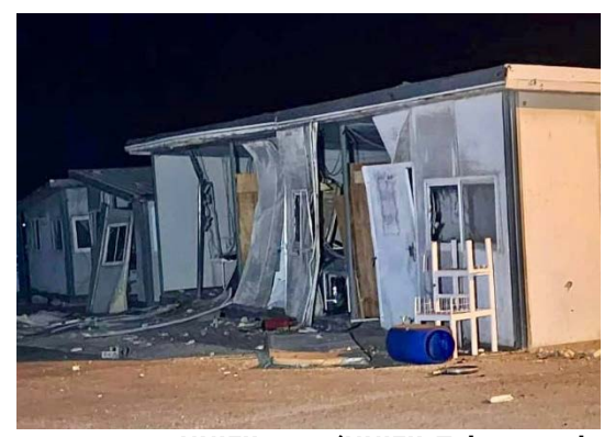
Damage to residential structures at a UNIFIL post (UNIFIL Telegram channel, October 25, 2024)