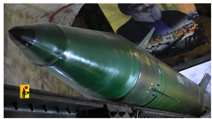
Right: Qader 2 missile moments before launch (Hezbollah combat information Telegram channel, October 23, 2024). Left: Launch of a Nasser 2 missile (Hezbollah combat information Telegram channel, October 25, 2024)

• Attack on the prime minister's residence: On the morning of October 19, 2024, a UAV launched from Lebanon struck the private residence of Prime Minister Benjamin Netanyahu in Caesarea. The prime minister and his family were not present and no one was injured, but the building was damaged (Israeli media, October 19 and 22, 2024). Hezbollah did not address the attack in its claims of responsibility, but on October 22, 2024, Mahmoud Afif, Hezbollah's head of media information, confirmed that Hezbollah took "full and exclusive responsibility for the attack on the criminal's [sic] home," claiming Hezbollah would try to kill him again (al-Manar, October 22, 2024).