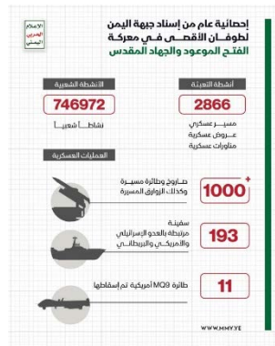
Diagram showing Houthi activity since the beginning of the war (the Houthi forces' media arm Telegram channel, October 6, 2024)