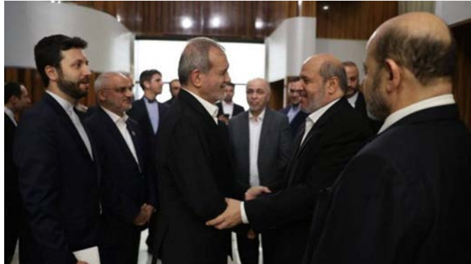
The Iranian president (right) meets with senior Hamas figures (IRNA, October 3, 2024)

leader Khaled Mashaal, deputy head of the political bureau in the Gaza Strip Khalil al-Haya, and member of the political bureau Hussam Badran. Pezeshkian strongly criticized the support of Western countries, particularly the United States, for Israel. He said the continuation of the “crimes of the Zionist regime” would lead to a crushing response from the Iranian armed forces, and that any further small mistake on its part would be met with a stronger and decisive response. He also called for unity among Muslim countries to stop Israel’s “crimes” (IRNA, October 3, 2024).