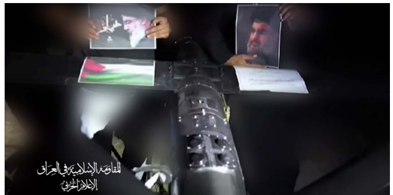
Right: Photos of Hassan Nasrallah on a drone (Islamic Resistance in Iraq Telegram channel, October 2, 2024). Left: Three drones being launched at various targets (Islamic Resistance in Iraq Telegram channel, October 5, 2024)

► According to “Iraqi security sources,” the drone that caused deaths and injuries in the Golan Heights is a new model with an initial speed of 370 kilometers per hour, capable of evading air defense systems. It can remain in the air for close to 27 hours (Mehr and 1news-iq.com, October 5, 2024).