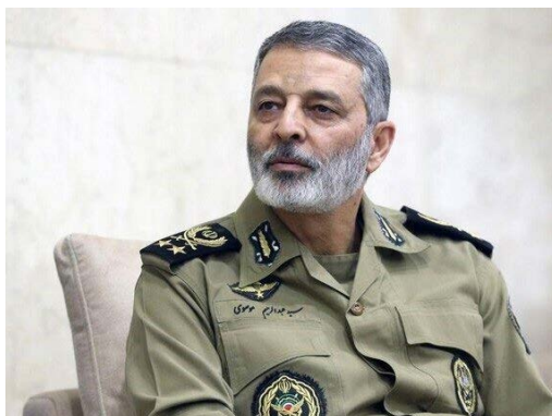
Abdolrahim Mousavi

◆ Iranian Army Commander Abdolrahim Mousavi warned that if the "Zionist regime" made a mistake in its calculations and carried out another "crazy act," the next blows would be harsher and more destructive (snn.ir, October 4, 2024).