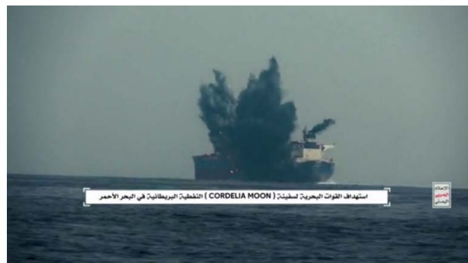
The alleged attack on the British tanker (Houthi combat media Telegram channel, October 3, 2024)

► On October 1, 2024, Houthi forces spokesman Yahya Saria claimed responsibility for three attacks against vessels (Yahya Saria’s X account, October 1, 2024): a combined attack against a British oil tanker in the Red Sea using ballistic and cruise missiles, a drone, and an unmanned surface vehicle (USV); The United Kingdom Maritime Trade Operations (UKMTO) confirmed that the tanker was hit by a USV and was damaged. However, there were no casualties and it continued on its way (UKMTO X account, 1 October 2024); A complex attack against a cargo ship using a cruise missile in the Indian Ocean and a UAV in the Arabian Sea. There has been no verification of the claims.