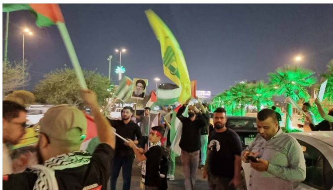
Celebrations in Iraq following the Iranian missile attack (Saberin News Telegram channel, October 1, 2024)

► Kata'ib Hezbollah praised the Iranian attack on Israel, saying it represented a commitment to the equation of confrontation “that the enemy is trying to undermine by harming civilians and civilian infrastructure.” It was also claimed that the Iranian attack proved “the level of distress in which the enemy finds itself and the ability of the axis operatives to keep their promises” (Kaf Telegram channel, October 1, 2024).