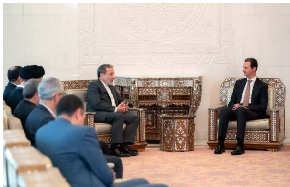
The meeting between Araghchi and Assad