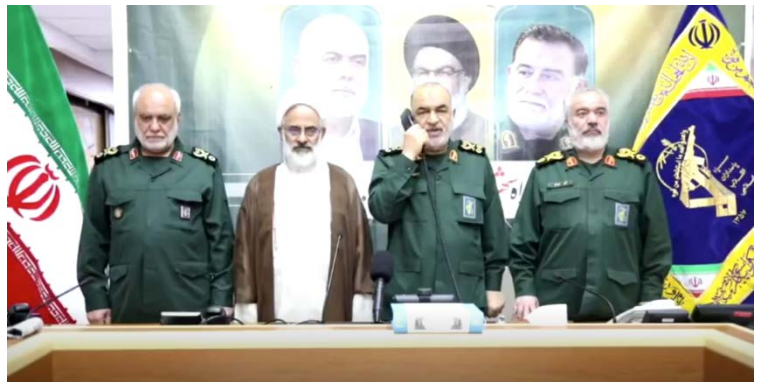
Right: The IRGC commander gives the order to launch (Tasnim, October 2, 2024).