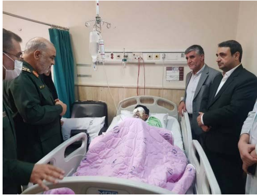
IRGC commander Hossein Salami visits wounded Lebanese in Iran (Khabar Online, September 19, 2024)