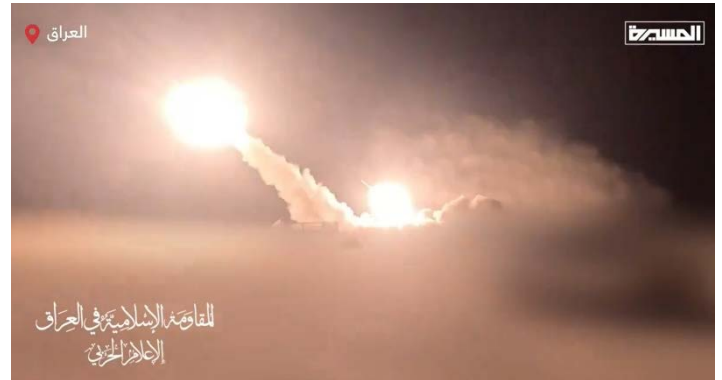
Right: Two al-Arqaab cruise missiles being launched (Islamic Resistance in Iraq Telegram channel, September 22, 2024). Left: Al-Arfad drones being launched (Islamic Resistance in Iraq Telegram channel, September 24, 2024)