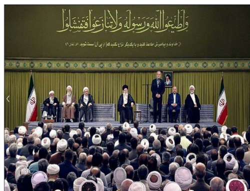
The Iranian Supreme Leader at a meeting in Tehran