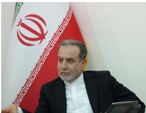
Iranian Foreign Minister Araghchi (Mehr, September 23, 2024)