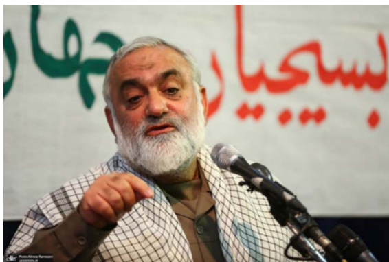
Mohammad-Reza Naqdi (Jamaran, September 21, 2024)

► A Jewish-Israeli businessman was arrested in Israel in August 2024 on suspicion of committing security offenses involving ties with Iranian regime intelligence officials to assassinate senior Israeli officials. The defendant was twice smuggled into Iran and received payment to target senior Israeli officials, including Prime Minister Netanyahu, Defense Minister Gallant, ISA chief Bar, and former Prime Minister Bennett, in revenge for the killing of Ismail Haniyeh in Tehran (Israeli media, September 19, 2024).