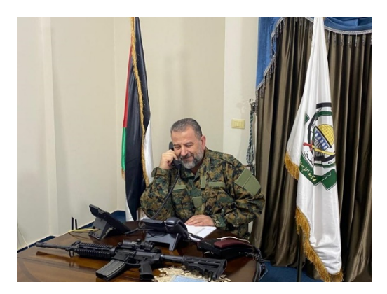
Photos of Saleh al-Arouri in uniform with an M-16 rifle on his desk, published in response to the Israeli prime minister's threat (Shehab, August 27, 2023)