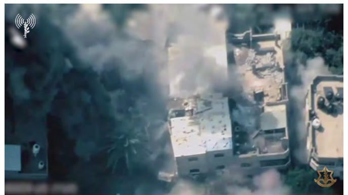
Aerial attacks on a munitions warehouse and an entrance shaft to a tunnel (IDF spokesman's website, October 9, 2023)