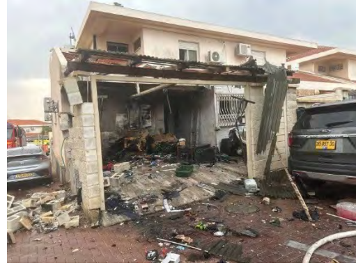
Right: A rocket hits a house in Sderot (QudsN Twitter account, October 9, 2023). Left: A house in an Israeli village near the border hit by rockets fired from Gaza (Shehab Twitter account, October 9, 2023)