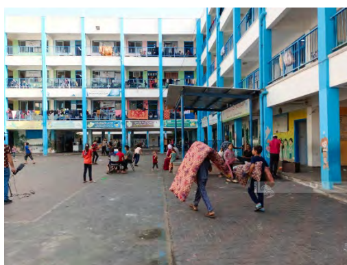
Absorption of residents in UNRWA schools (Wafa, October 9, 2023)

► According to UNRWA, 74,000 Gazans have been taken in by its 64 schools, which were opened specifically to serve as shelters for residents who lost their houses and for those who left them because of the war. (October 9, 2023). UNRWA claimed it could not meet the needs of all the asylum seekers in the Gaza Strip and could meet needs for two weeks only (al-Arabiya, October 8, 2023).