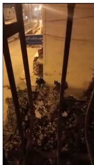
Photos from a video documenting shooting at the Qalandia checkpoint