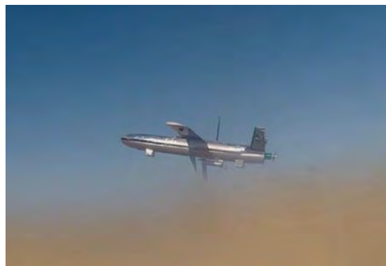
A Ziyad suicide UAV (Right: Jerusalem Brigades Telegram channel, October 9, 2023) (Left: Shams News Twitter account, October 4, 2023)