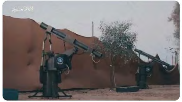
Photographs from a video of Hamas' military-terrorist wing unveiling the locally-produced Mitvar1 aerial defense systems, which they claim were used for the first time Operation al-Aqsa Storm (Izz al-Din Qassam Brigades Telegram channel, October 9, 2023)