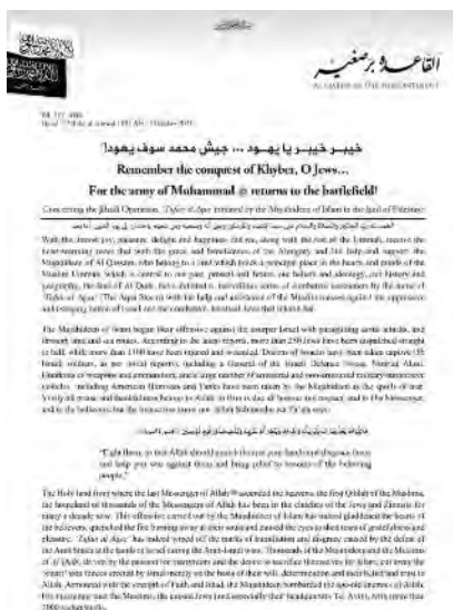
Announcement by Al-Qaeda’s branch in the Indian subcontinent (Telegram, October 8, 2023)

► Al-Qaeda’s branch in the Indian subcontinent issued a statement in support of attacking Jews. The announcement begins with the slogan “Khaybar, Khaybar, O Jews, Muhammad’s army will return,” referring to the Battle of Khaybar, which took place at the beginning of Islam, in 628 CE between Muslims and the Jews of the city of Khaybar, on the periphery of the city of Medina, in which many of the city’s Jews were massacred. The announcement praises Hamas’ attack on the “infidel Jews” and stresses that it “warms the hearts of Muslims.” The announcement also stressed the importance of Jerusalem to Islam (Telegram, October 8, 2023).