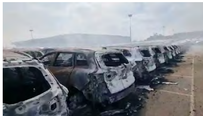
Cars burned in a fire caused by a rocket in a parking lot near the Gaza Strip where 200 vehicles were parked, (Shehab Twitter account, October 8, 2023)

► On October 9, 2023, at noon, several rockets were launched from Lebanon towards the north of the country. The event is under investigation.