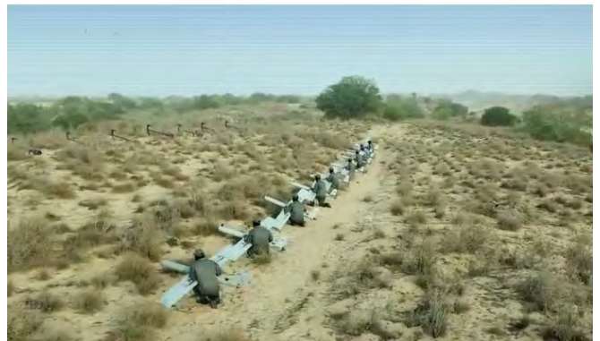
Photographs from a video showing al-Zawari "suicide" UAVs, which they say supported the preliminary fire for the Izz al-Din Qassam Brigades terrorists to enter Israeli territory (Izz al-Din Qassam Brigades Telegram channel, October 8, 2023)