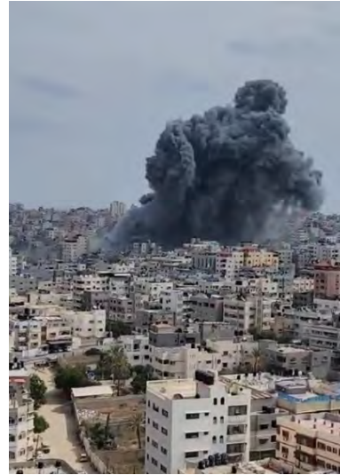
Right: Israeli Air Force attack in western Gaza City. Left: Aerial attack on the al-Shati refugee camp (Twitter account of photojournalist Hassan Aslih, October 9, 2023)