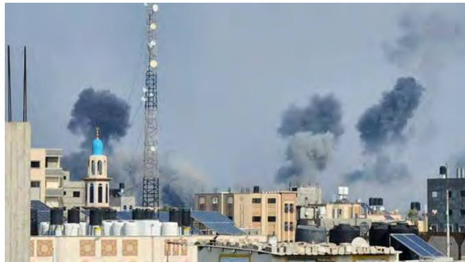
Right: Air Force attack on Beit Hanoun. Left: The attack on the branch of Hamas' Islamic National Bank in the Rimal neighborhood of Gaza City (Shehab Twitter account, October 8, 2023)