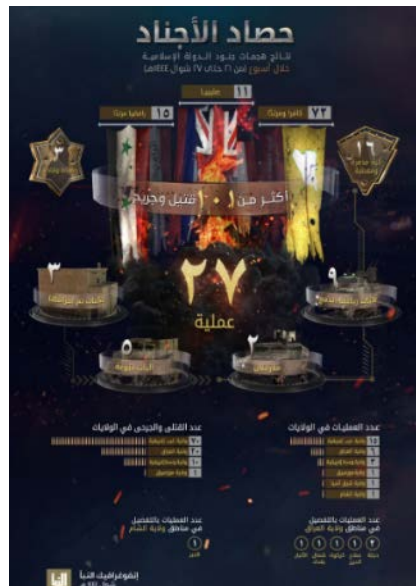
Summary of ISIS's attacks (Al-Naba weekly, Telegram, May 18, 2023)

► An infographic published by ISIS's Al-Naba weekly, summing up ISIS's activity in the period between May 11-17, 2023, indicates that during this period, ISIS operatives carried out 27 attacks in the various provinces (compared with 12 in the previous week). The West Africa Province carried out the highest number of attacks (15). Attacks carried out in the other provinces: Iraq (6); Central Africa (3); Mozambique (1); East Asia (1); and Syria (1). A total of 101 people were killed and wounded in the attacks, compared with 28 in the previous week. The largest number of casualties was in the West Africa Province (70). The rest of the dead and wounded: Iraq (20); Central Africa (10); and Mozambique (1) (Al-Naba weekly, Telegram, May 18, 2023)