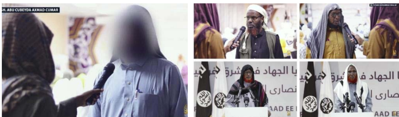
Photographs from the conference alongside the interview with the organization’s leader (Telegram, May 21, 2023)

► Al-Shabaab’s media arm, Al-Kataeb, released a video on May 21, 2023, including details about a conference that it convened on May 8-15, 2023, attended by 130 of the organization’s leaders, senior clerics affiliated with it, and local leaders close to the organization, to discuss the situation in Somalia in light of the activity of the Somali government and the United States against the organization. At the conference, elements affiliated with the organization were called upon to unite the ranks and show adherence to the religion of Islam and strengthen the spirit of jihad, in preparation for the continuation of the fighting. The organization’s leader, Sheikh Ahmad Omar Abu Obeida, appeared (with his face blurred), noting that the organization had struck its enemies severely and calling on the organization’s supporters to attack its enemies. According to Abu Obeida, Muslims in Somalia and East Africa are more responsive to joining jihad than in recent years (Shahada News Agency, May 21, 2023).