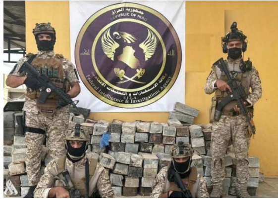
The ammunition found in the Al-Anbar Province (Iraqi News Agency, May 23, 2023)