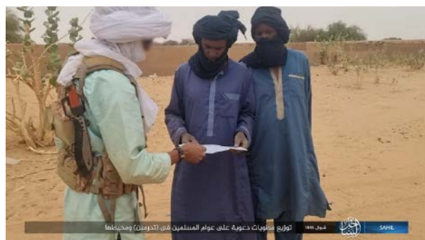
ISIS operatives and residents during Da'was activity