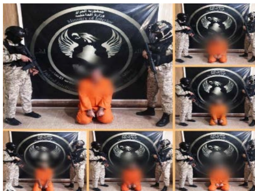
The six detained ISIS operatives (Iraqi News Agency, May 18, 2023)

► On May 18, 2023, teams of the Federal Intelligence and Investigations Agency, which operates as part of the Iraqi Ministry of the Interior, detained six wanted ISIS operatives in the Salah al-Din Province (exact locations were not specified). The detainees had taken part in planting IEDs, blowing up residential buildings, and attacking bases of the security forces when ISIS controlled some of the areas (Iraqi News Agency, May 18, 2023).