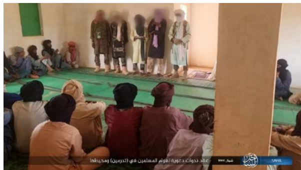
ISIS operatives and residents during Da'wa activity (Telegram, May 17, 2023)