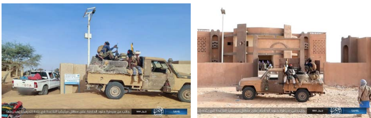
ISIS operatives in Al-Qaeda's strongholds in Tidermène (Telegram, May 17, 2023)