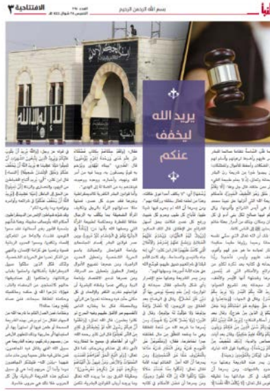
The article “Allah wants to make things easier for you” (Al-Naba weekly, Telegram, May 18, 2023)

jihad is the only way to lead to the implementation of Sharia and the elimination of heresy in the world (Al-Naba weekly, Telegram, May 18, 2023).