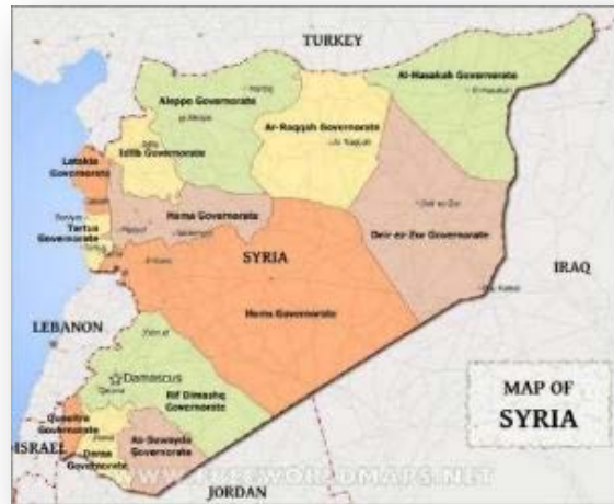
Provinces of Syria (Free World Maps)