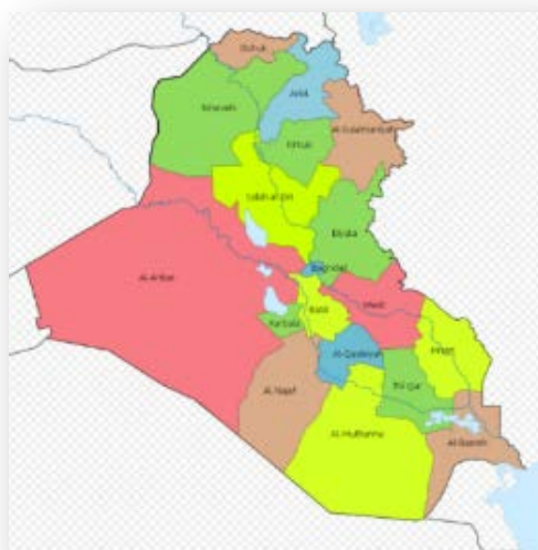
Provinces of Iraq (Wikipedia)