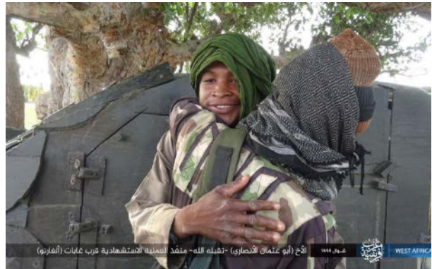
ISIS suicide bomber in a car bomb southeast of Maiduguri (Telegram, May 18, 2023)