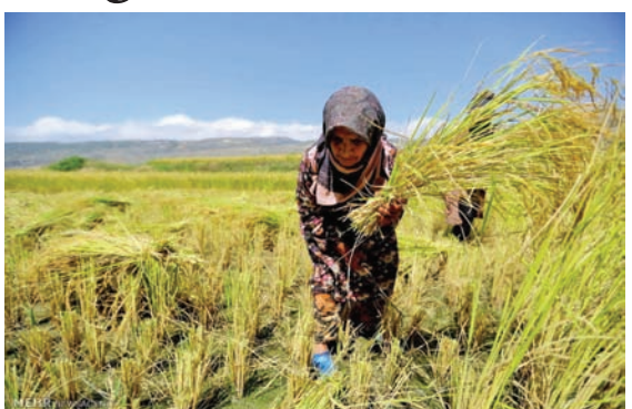
people, especially the poor, in every region of the world. The most conservative estimate shows they are unaffordable for

The report states that healthy diets are unaffordable to many