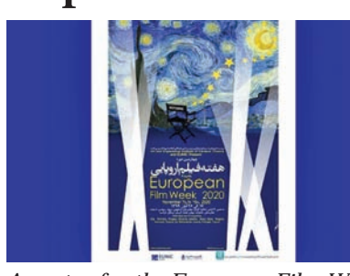
A poster for the European Film Week in Tehran.

The 2019 edition of the festival opened in