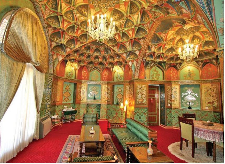
plasterwork and glamorous paintings. Some say that in architecture Hasht Behesht refers to a specific type of floor plan common in Persian architecture,

Despite its modest size, the palace has a rather complicated plan one has the feeling of coming into a labyrinth of interlinked rectangular and octagonal rooms. The ceiling that covers the main section in the building as well as the walls of the rooms is lined with colorful