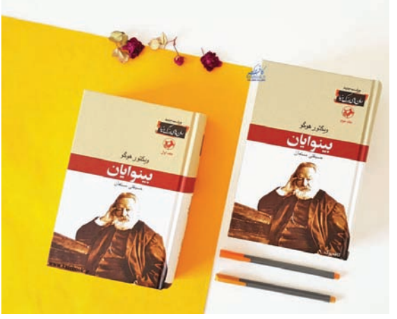
A copy of the Persian translation of "Les Misérables" published by Amirkabir Publications in two volumes.

Public category at the 2A Continental Architectural Award for Asia and Europe in Barcelona, Spain.