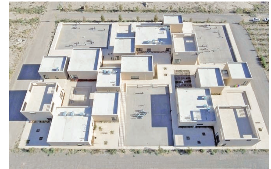
An aerial picture of the Nur-e Mobin Primary School in Bastam, Semnan Province, Iran.

TEHRAN — The Academic Center for Education, Culture and Research in Tehran