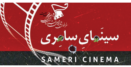
A poster for "Samiri Cinema" at the Resistance International Film Festival.

The second part of the festival will be held from November 21 to 27 to celebrate the anniversary of Basij Day, which falls on November 25.