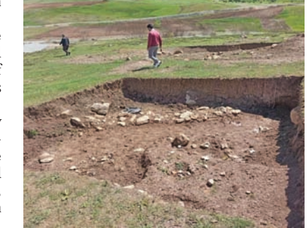
Urartu and later of Media. In the 4th century BC, it was conquered by Alexander

The region has been the seat of several ancient civilizations. It formed part of