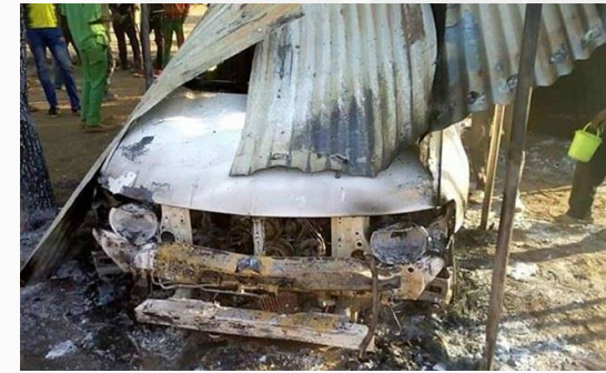
The aftermath of the Mansila attack by JNIM.

25 JAN 19 : Suspected JNIM or ISGS abducted then assassinated local notable and imam deputy of Boukari village, Oudalan Province, Sahel Region. His body was recovered between Petoy and Oursi.