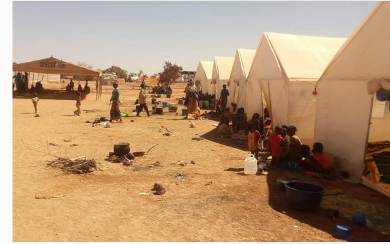
Yirgou displaced population.

31 Dec 2018 - 02 JAN 19 : Suspected Ansaroul Islam carried an attack against the village of Yirgou, Centre-Nord Region. This attack against Yirgou village, which is inhabited mainly by Mossi ethnic group instigated a violent response by Koglweogo and Mossi self-defense militias against Fulani community in the area. The act of vengeance caused death of between 50 and 76 civilians from Fulani community. Among casualties Yirgou village chief . The incident forced many families, more than 20,000 people to abandon their homes (see image to the right).